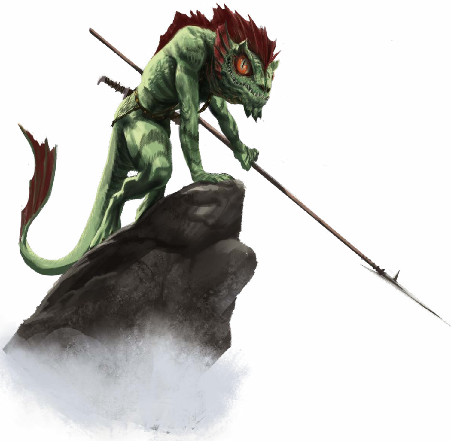
SEA DEVIL SCOUT