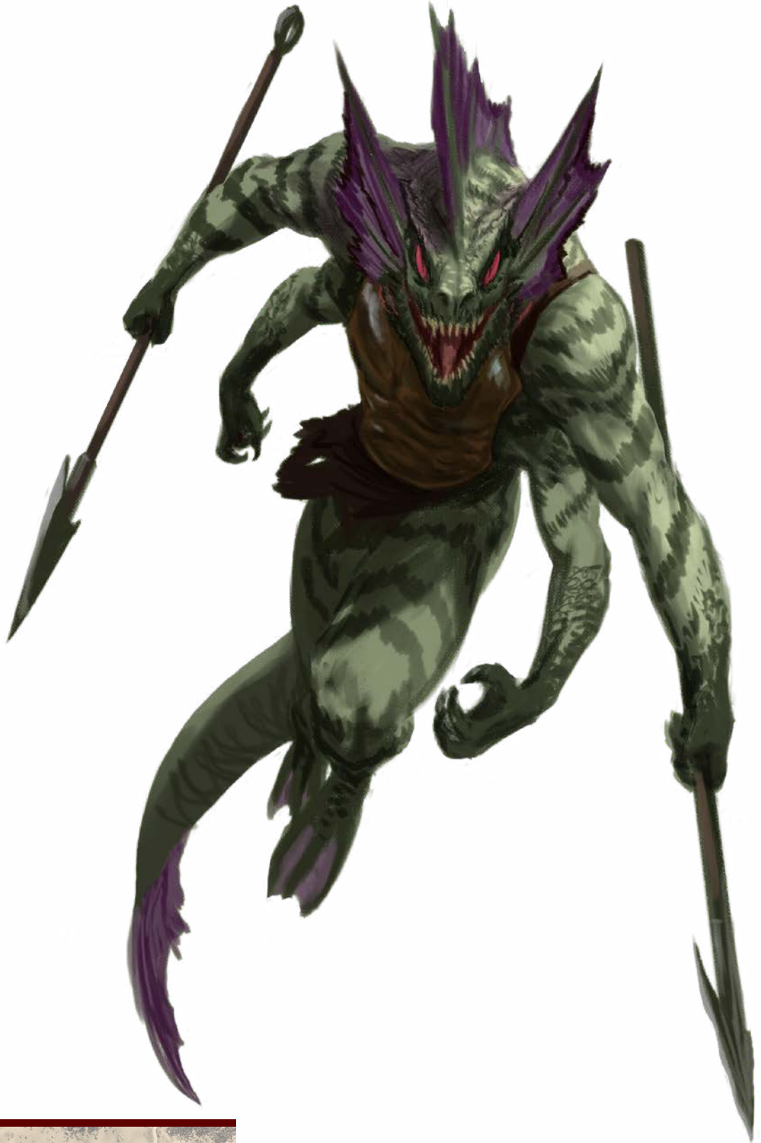
SEA DEVIL INVADER